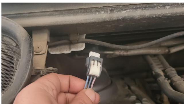
DPF Differential Pressure Sensor Socket