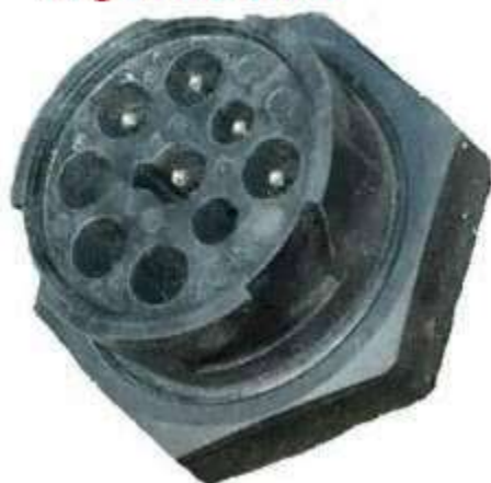
Ford Cargo 1846 - 460 PS - 9 Pin Diagnostic Socket